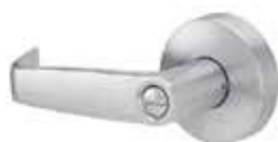
Small Rose (Only available in Dane Lever)

The Falcon W comes in different rose diameters to meet your customer needs. The Large Rose 3-1/2" diameter and a Small Rose 2 9/16" diameter to meet your narrow stile door requirements.