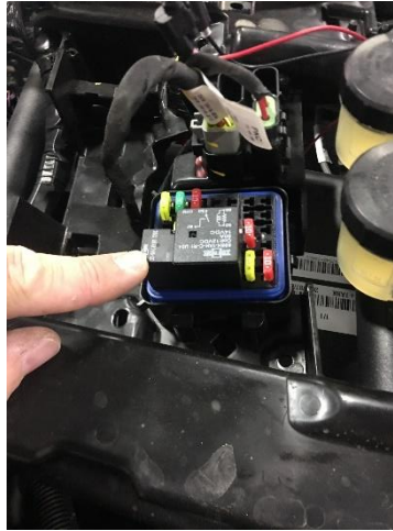
Brake Switch Relay