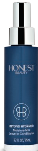
HONEST BEAUTY Beyond Hydrated Moisture Milk Leave-In Conditioner ($20, Ulta).