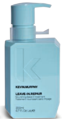
KEVIN.MURPHY Leave-In.Repair Treatment ($32, kevinmurphy.com.au for salons).