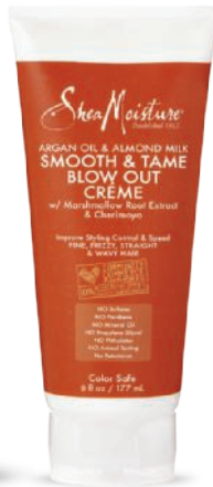
SHEAMOISTURE Argan Oil & Almond Milk Smooth & Tame Blow Out Crème ($11, Target).