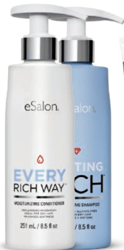
ESALON Getting Rich Moisturizing Shampoo and Every Rich Way Moisturizing Conditioner ($15 each, esalon.com ).

NO MATTER THE SEASON, SLAYING A STYLE STARTS WITH A HEALTHY MANE. KEEP STRANDS HYDRATED AND STATIC-FREE, AND BREAKAGE AT BAY WITH A SOLID HAIR CARE LINEUP