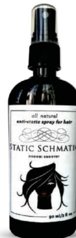
STATIC SCHMATIC Anti-Static Spray for Hair ($12, staticschmatic.com ).