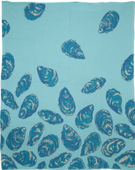
OYSTER BL01OY1 Seafoam/Mid Blue/Aqua/Flax