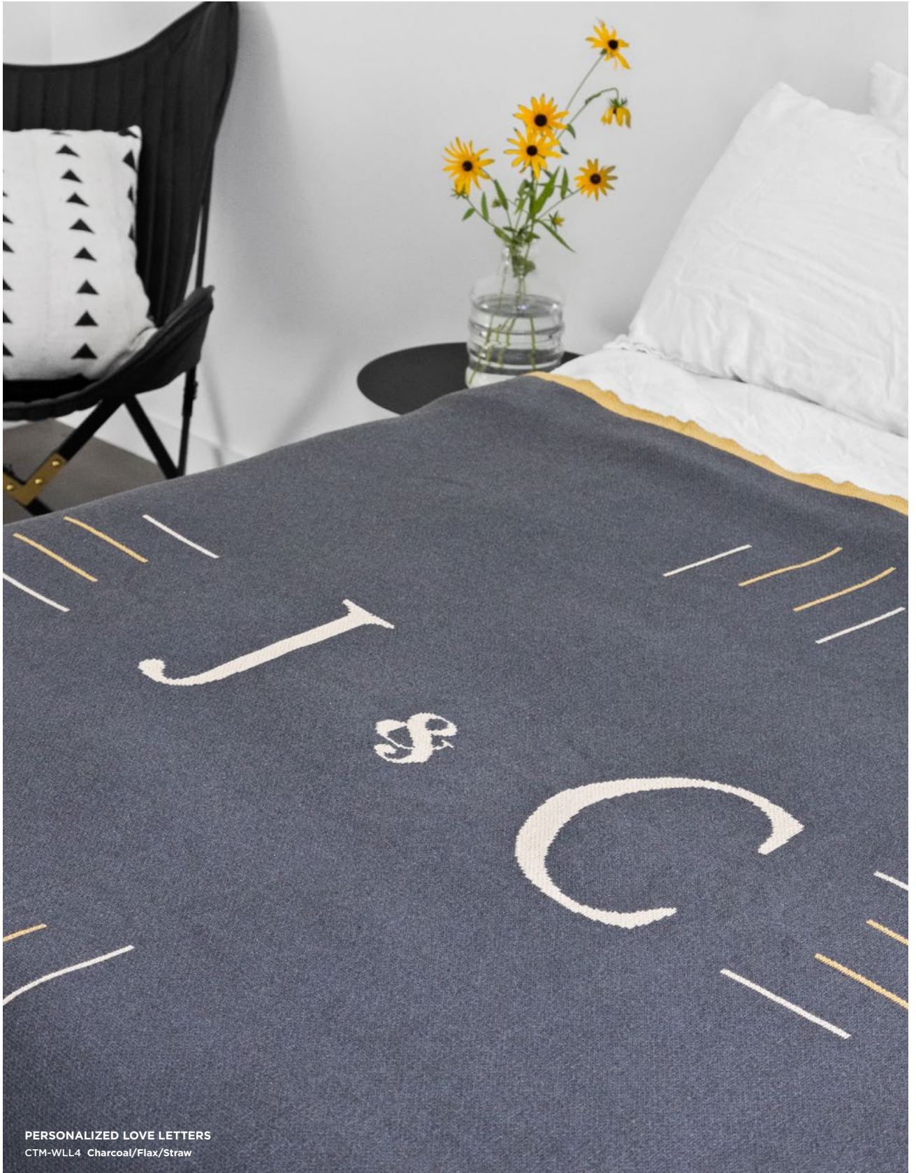
PERSONALIZED LOVE LETTERS CTM-WLL4 Charcoal/Flax/Straw