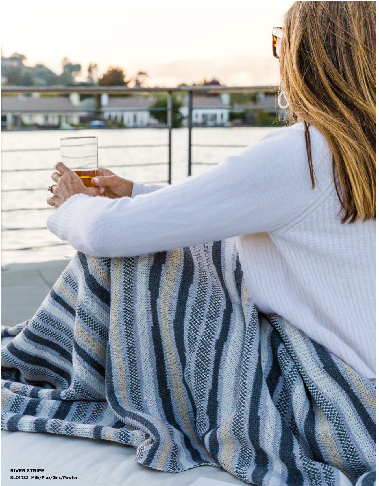
RIVER STRIPE BL01RS3 Milk/Flax/Gris/Pewter