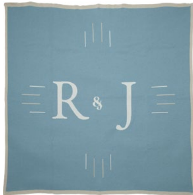
PERSONALIZED LOVE LETTERS CTM-WLL3 Rain/Milk/Flax