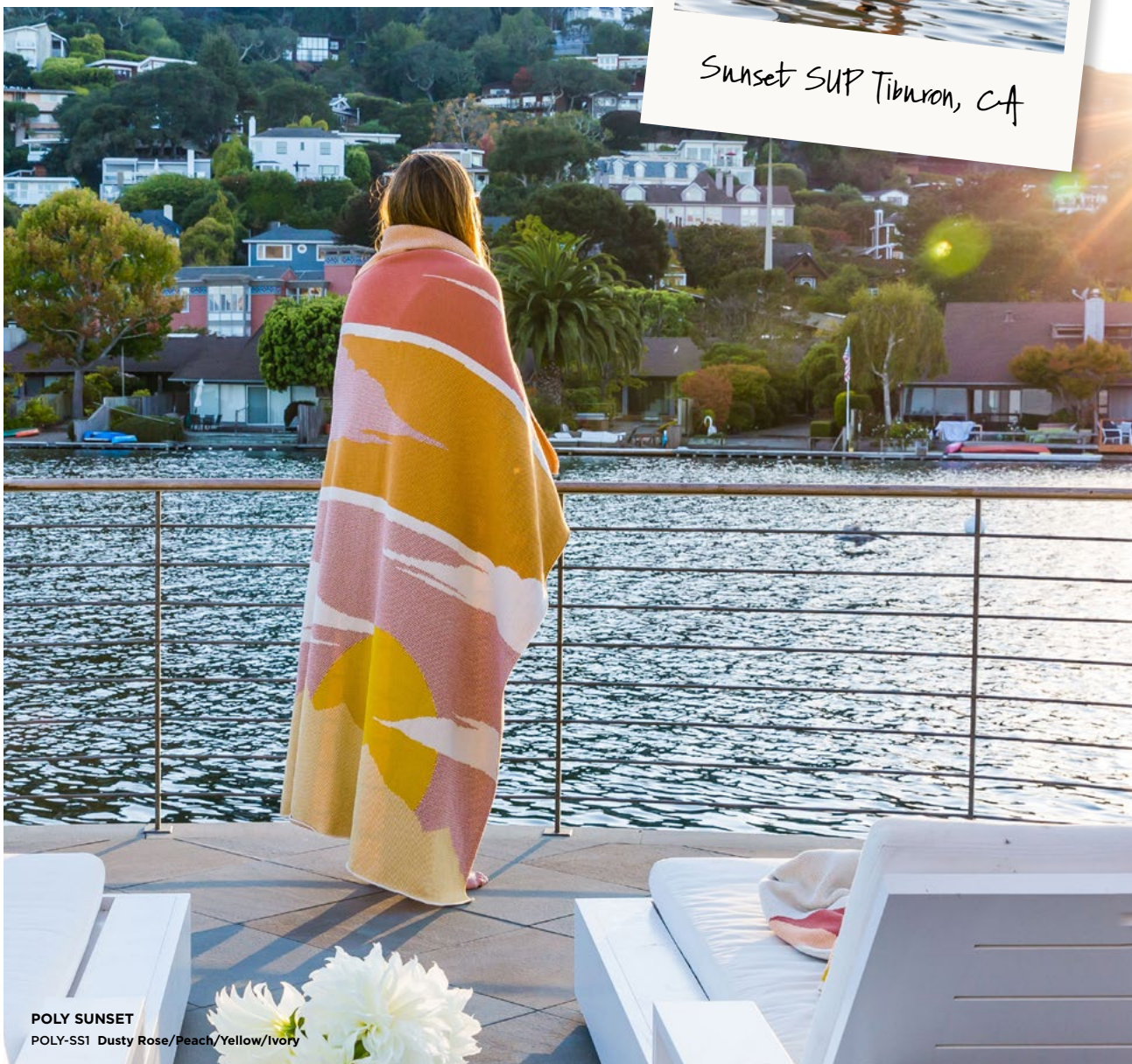
POLY SUNSET POLY-SS1 Dusty Rose/Peach/Yellow/Ivory