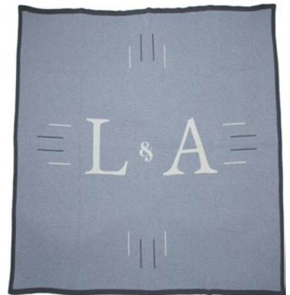
PERSONALIZED LOVE LETTERS CTM-WLL2 Aluminum/Milk/Pewter