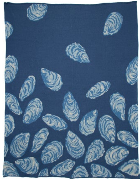
OYSTER BL01OY4 Slate/Mid Blue/Rain/Ceniza