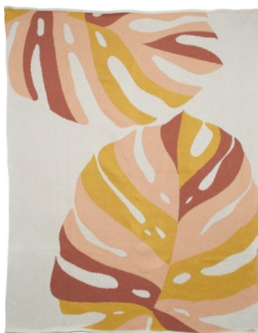
MONSTERA POLY-ML2 Ivory/Dusty Rose/Yellow/Peach