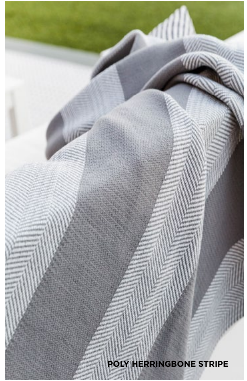
POLY HERRINGBONE STRIPE