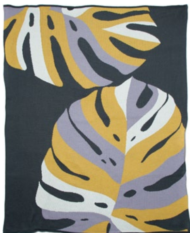
MONSTERA POLY-ML1 Night/White/Lilac/Yellow