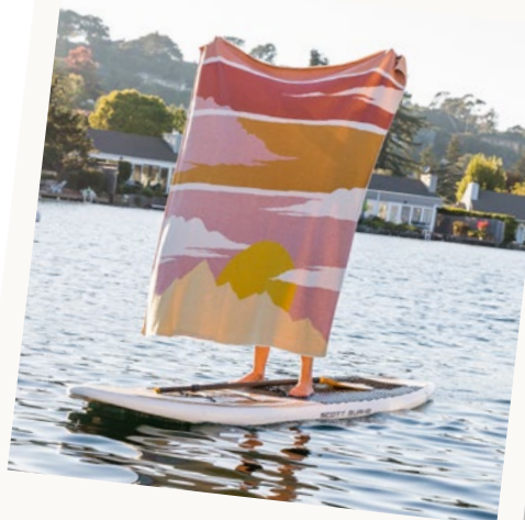
Sunset SUP Tiburon, CA