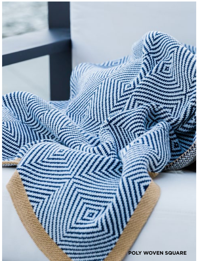
POLY WOVEN SQUARE