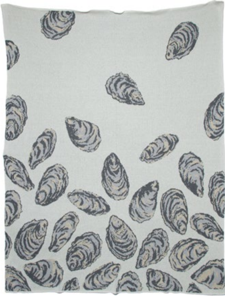
OYSTER BL01OY3 Milk/Pewter/Gris/Flax