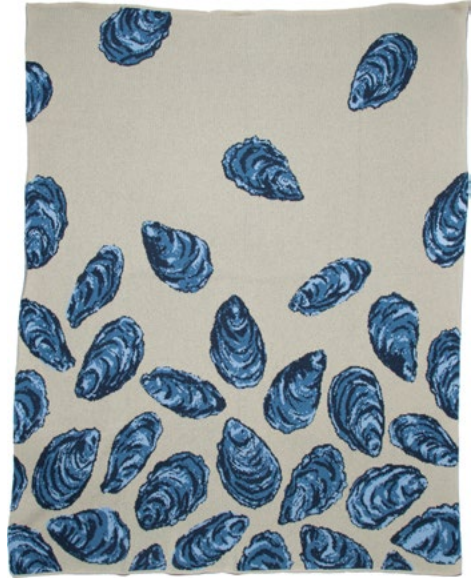
OYSTER BL01OY2 Flax/Navy Jeans/Mid Blue/Sky