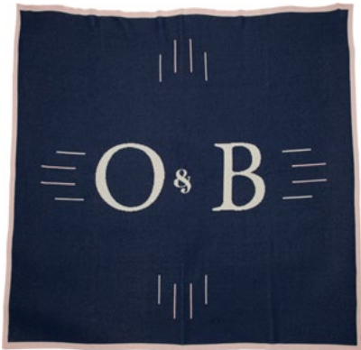
PERSONALIZED LOVE LETTERS CTM-WLL1 Marine/Flax/Cameo