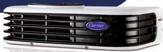
NEOS 100 S, Split concept

Alternator driven, the Neos refrigeration range combines constant cooling and heating for vehicles up to 6 m 3 with flexible installation. Available in 2 versions, Slim & Split, it is a versatile and reliable choice for customers wanting cargo-protection, reliability and driver's comfort.