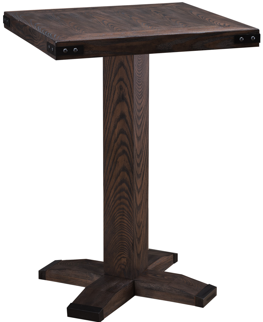
Shown in Whiskey Barrel finish.