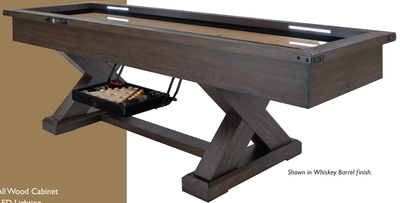
Shown in Whiskey Barrel finish.

With the success of our Cumberland billiards table, it was only fitting to add a matching shuffleboard. With its stunning design and meticulous craftsmanship, the Cumberland shuffleboard will elevate any game room. Strong X leg design, finger jointed cabinet, metal accents, and built in LED lights take this table to the next level.