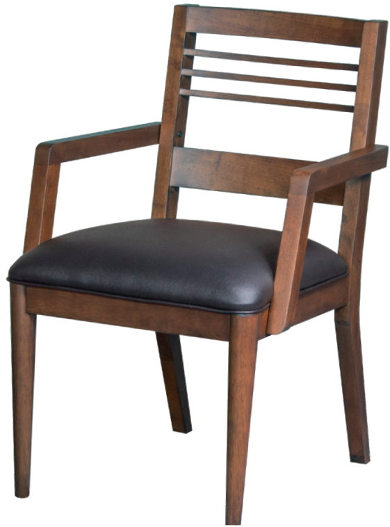
Shown in Walnut finish.