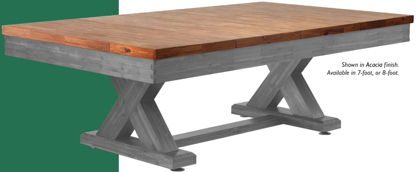
Shown in Acacia finish. Available in 7-foot, or 8-foot.

Turn your pool table into a dining table or game table with the Legacy Billiards Billiard Table Dining Top. Now available in solid tropical woods, this addition to your pool table adds functionality and beauty. Secured at the joints by magnets these table top pieces go together and separate easily. In addition, you don't have to worry about those pesky wooden dowels breaking. Our dining tops are available in finishes to match all our 7' and 8' billiard tables, thus offering you the option to convert any of our pool tables.