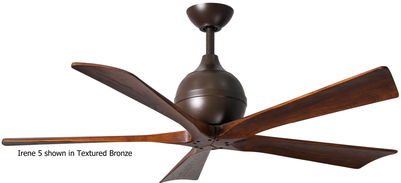
Irene 5 shown in Textured Bronze

Cutting a figure like no other, Irene is rustic, yet strikingly modern with either three or five neatly joined propeller-shaped, solid walnut-stained wooden blades. A spherical motor housing complements its minimal profile. Irene is streamline while still appearing warm and natural.