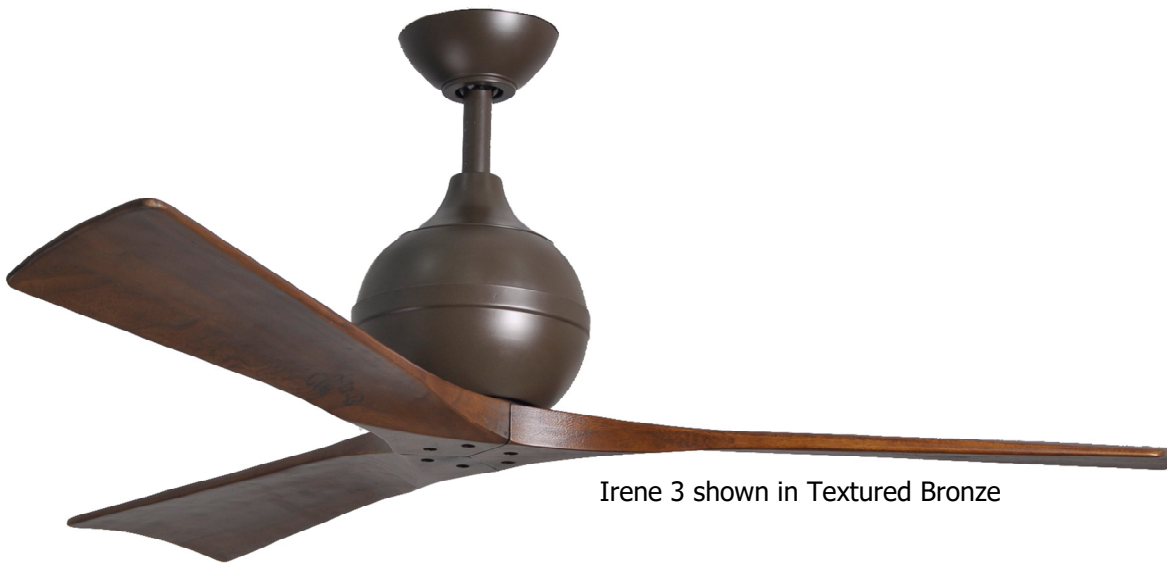
Irene 3 shown in Textured Bronze