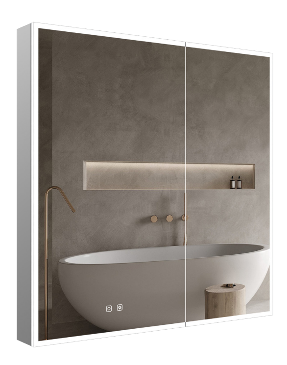
Size (WxHxD): 36" x 36" x 4 5/8" (915mm x 915mm x 117mm)