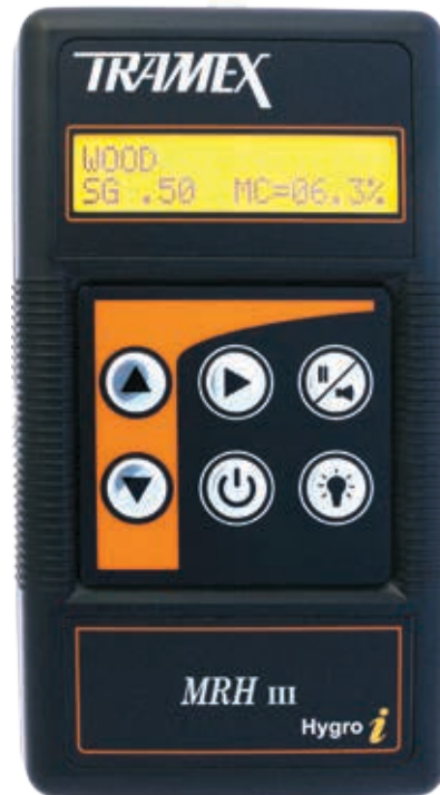
Product order code: MRH3

The Moisture and Relative Humidity MRH III is a hand-held digital moisture meter calibrated for most building materials. It also incorporates optional plug-in heavy-duty pin-type wood probes and Hygro-i® probes for measurement of relative humidity and ambient conditions and allowing for testing of concrete per ASTM F2170 or BS 8201 (with optional sleeves or hood). Suitable for many industries including Flooring, Water Damage Restoration, Indoor Air Quality, Home Inspection and Pest Control.