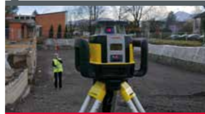
GRADE WITH DIAL-IN