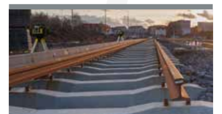
HORIZONTAL, INVISIBLE & FULL AUTOMATIC DUAL GRADE WITH DIAL-IN AND MACHINE COMPATIBILITY