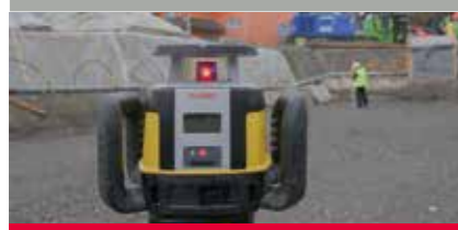
HORIZONTAL ONE-BUTTON LASER