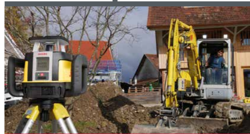
HORIZONTAL, VERTICAL & FULLY-AUTOMATIC DUAL GRADE WITH DIAL-IN AND MACHINE COMPATIBILITY