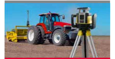
HORIZONTAL, INVISIBLE & FULL AUTOMATIC DUAL GRADE WITH DIAL-IN AND MACHINE COMPATIBILITY