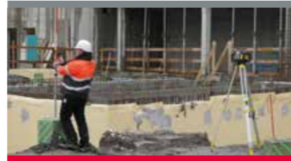
HORIZONTAL & SLOPE