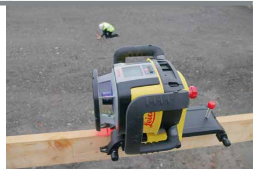
HORIZONTAL, VERTICAL & MANUAL SLOPE