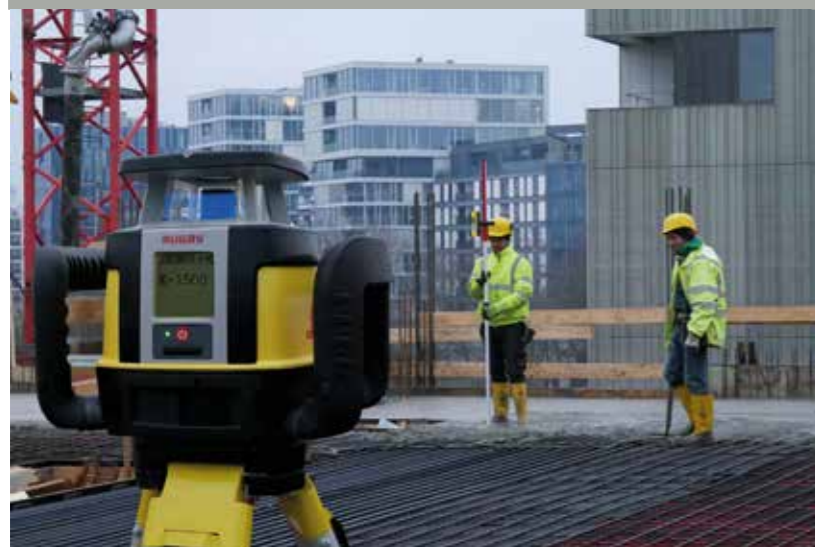
HORIZONTAL, VERTICAL & FULLY-AUTOMATIC SINGLE GRADE WITH DIAL-IN