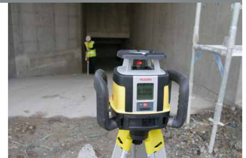
HORIZONTAL, VERTICAL & FULLY-AUTOMATIC DUAL GRADE WITH DIAL-IN