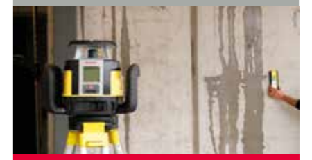
HORIZONTAL ONE-BUTTON LASER