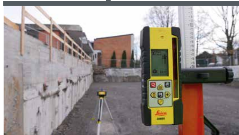
HORIZONTAL & SLOPE LASER