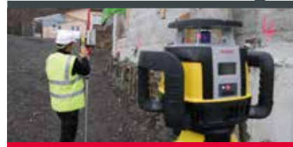
HORIZONTAL & SINGLE GRADE WITH DIAL-IN