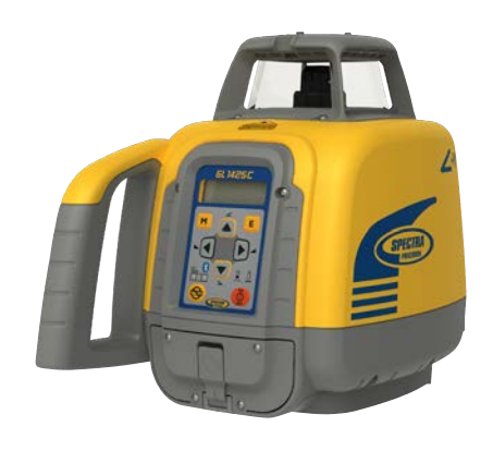
GL1425C features an enclosed lighthouse for superior ruggedness and environmental protection