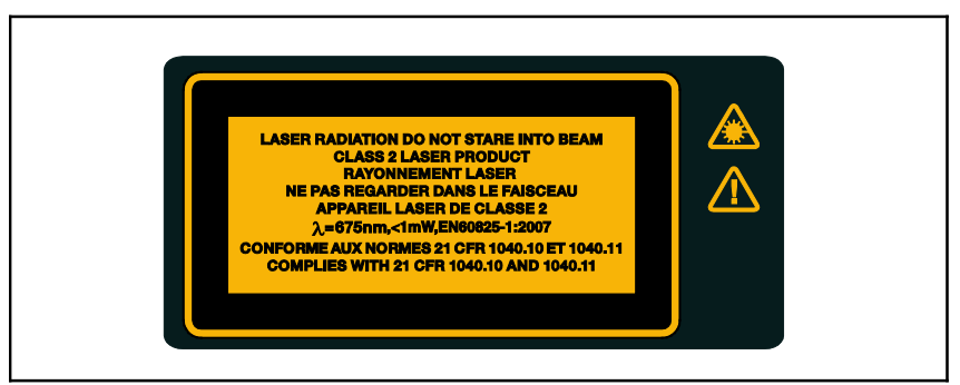
Figure 3-1. Laser safety warning

On page 10, in the Maintenance section, add the following after the Caution: