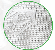
Silver coated metallised UltraLux film - durable and highly reflective