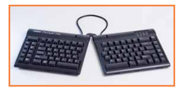
A flexible pivot tether connects both modules allowing an infinite range of splay and greatly reducing ulnar deviation.