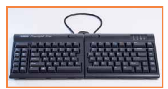
The narrow footprint of only 15 3/8 inches wide provides for close placement of any pointing device, reducing over-reach issues.