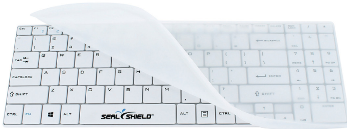
CleanWipe Cover Included (Latex-Free)

Models: SSKSV099 (Corded), SSKSV099W (RF Wireless), SSKSV099BT (Bluetooth® Wireless)