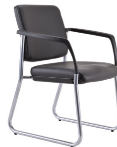
Featured in custom Black Dillon PU