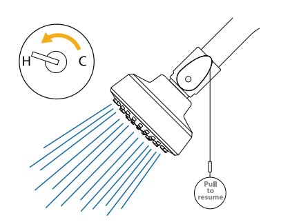
Turn on shower.

Continue with your typical routine - the things you do while waiting for the shower to become warm.