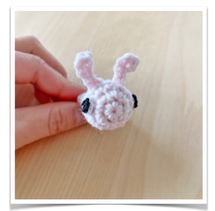
Step 2 - front view