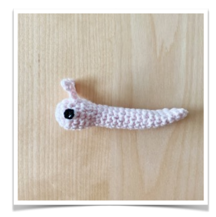
Step 2 - side view