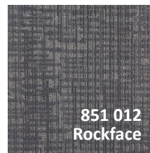
851 012 Rockface