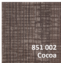
851 002 Cocoa