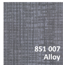
851 007 Alloy