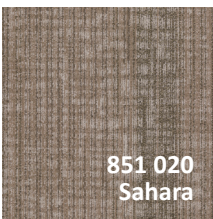
851 020 Sahara