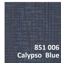
851 006 Calypso Blue