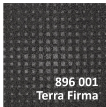
896 001 Terra Firma