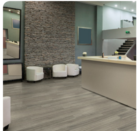
Winter Gates-UPP 7121