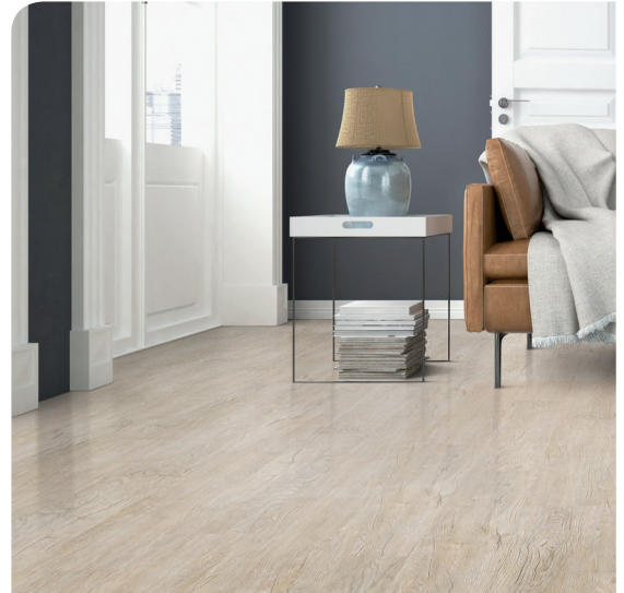
Parkhill® EIR - PKH 352