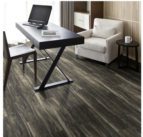
Evening Shadow-DRB 922