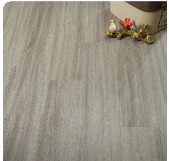
Winter Gates-BNP 7654