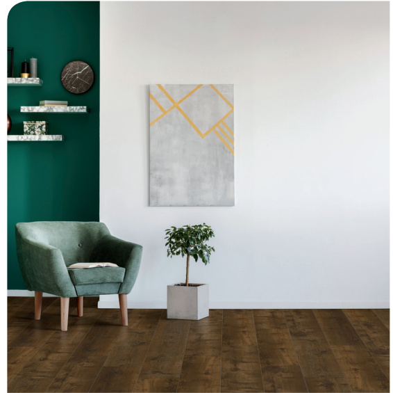
Blitz - STX 6903