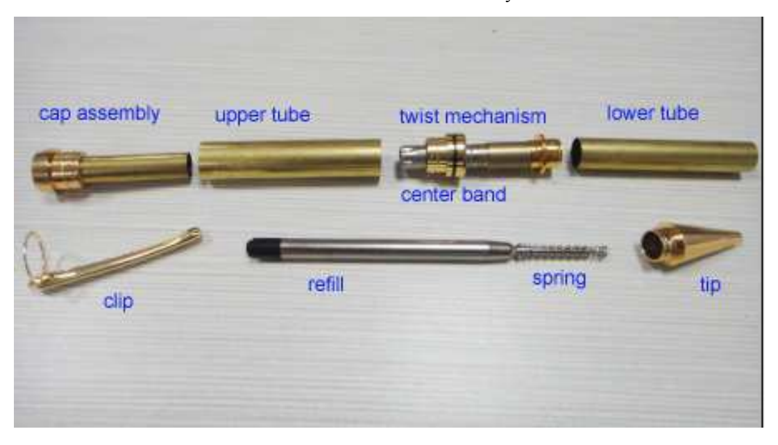
DIAGRAM A -- Assembly