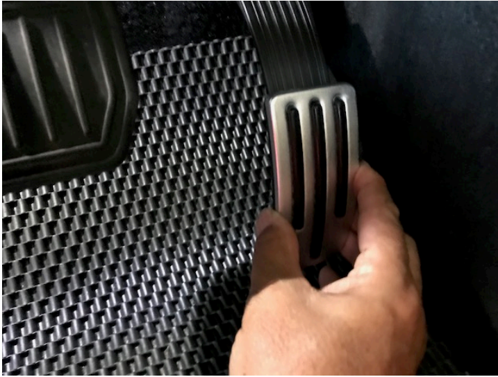
Photo # 2. Slide pedal cover upward with grommet covering the OEM pedal

WARNING: Be certain that the accelerator pedal cover grommet on the back of the EVANNEX pedal cover is positioned so that it covers the edges of the OEM accelerator pedal base on all sides . Use your fingers to “feel” that the grommet covers the base. If the pedal cover is improperly attached, it can detach, and cause a driving hazard.