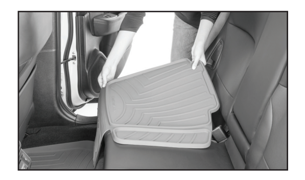
Place Child Car Seat Protector on top of the vehicle seat. Front flap should fall over the front of the seat.