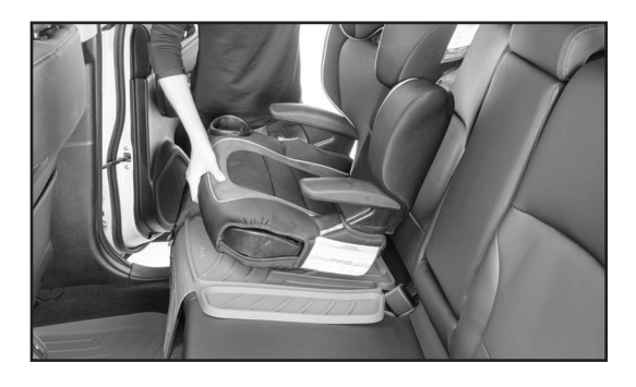
Place your child car seat on top and strap it in as you normally would, adhering to all safety recommendations.