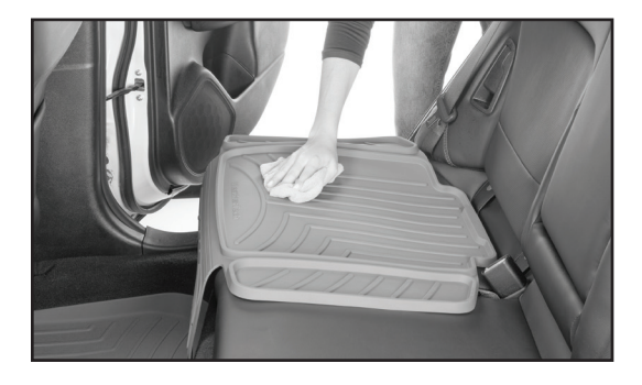
To clean Child Car Seat Protector, simply wipe with a soft damp cloth and/or mild detergent. For best results, use WeatherTech TechCare® FloorLiner and FloorMat Cleaner.