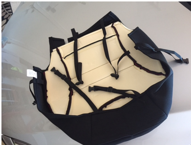
Figure 3. Seat cover for seat cushion, fastening straps

Front Seat Covers Installation Instructions (copyright © 2016, Evannex®)