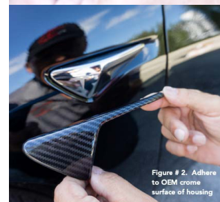
Figure # 2. Adhere to OEM chrome surface of housing