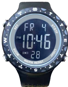
Button functions shown with setting functions in parentheses

Press MODE repeatedly to step through modes: Time, Alarm (AL), Stopwatch (SP), and Time 2 (T2). Press MODE to exit current mode and return to Time mode.