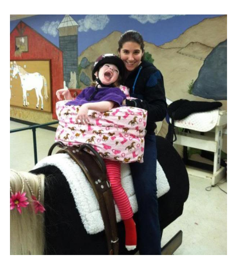
Great for indoor activities, therapies and sensory rooms

exercises, strategies, and therapies for children and adults with disabilities. Offering a