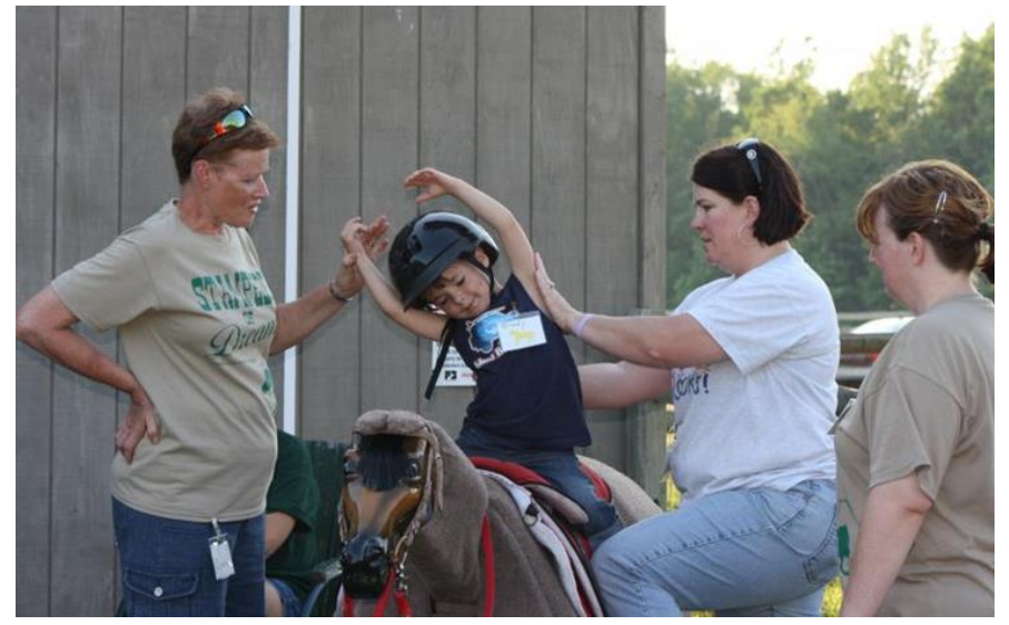
Evaluations, stretching and warm up exercises prior to a mounted lesson make for a more effective lesson for student and volunteers. The Equicizer is a popular tool with Path-International and RDA programs world-wide.

for their programs for many years. The Equicizer can also be found in non-equine related clinical settings such as rehabilitation centers, hospitals, schools for the disabled, youth outreach programs, and private homes. The Equicizer offers fun, alternative ways of conducting therapeutic