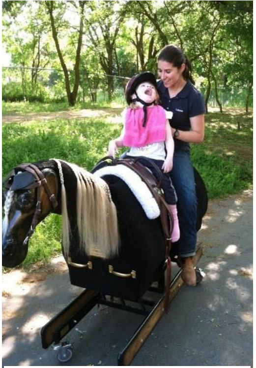
Riding tandem is often beneficial to riders who need additional support.

Riding tandem is also a popular method of using the Equicizer as it can carry more weight than a real horse. The Equicizer can safely carry up to 500 lb. Riding tandem is especially beneficial to riders who need additional support. In many cases, riders will develop the strength, coordination, and ability to make the Equicizer move on their own and the feeling of satisfaction for them is beyond motivating and inspiring!