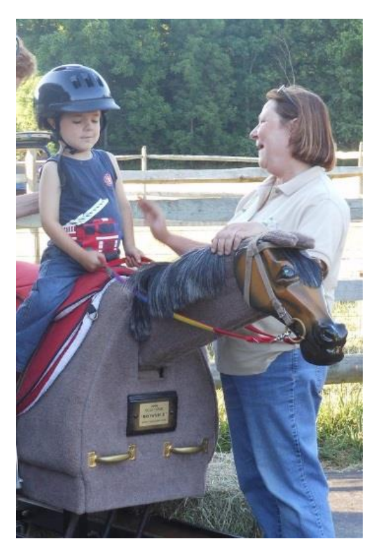
If assistance is needed, the movement of the Equicizer can be generated by placing a hand along the Equicizer's neck.

There is nothing to plug in or turn on and the Equicizer is virtually maintenance free! The very safe non-motorized Equicizer has a spring balanced mechanism that when in motion, moves and has the sensation of riding a real horse. The motion is easily activated and initiated by the rider with the intensity of the movement entirely dependent upon the rider's effort, strength, and ability.