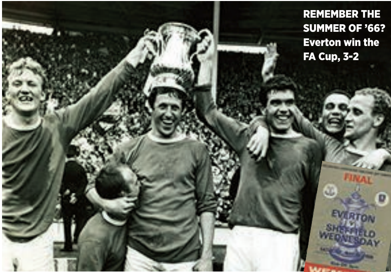
REMEMBER THE SUMMER OF '66? Everton win the FA Cup, 3-2