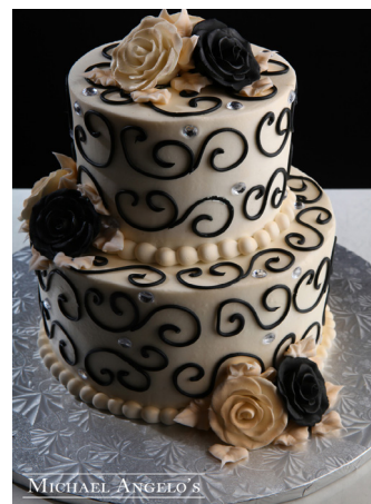
SWIRLS & SINGLE GEMS