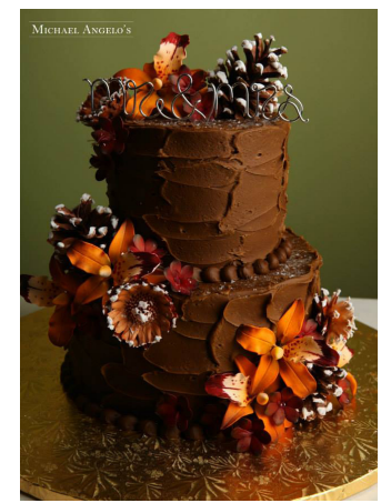
BUTTERCREAM RUSTIC STUCCO