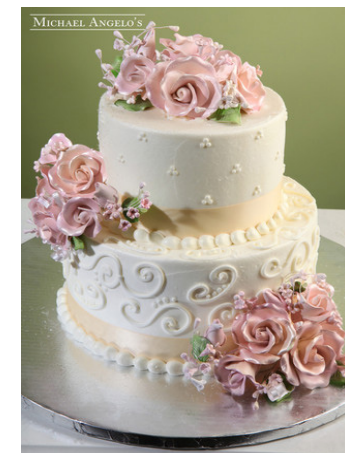
BUTTERCREAM SWIRLS & DOTS