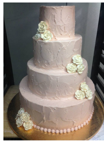
BUTTERCREAM SOFT STUCCO