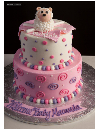
BUTTERCREAM SPIRALS & POLKA DOTS