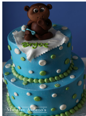
BUTTERCREAM POLKA DOTS