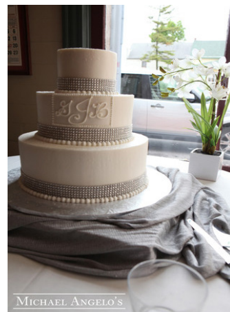
GEM RIBBON (SEE RIBBON BELOW)