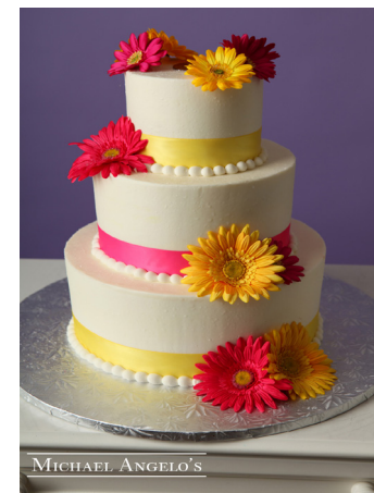
SATIN RIBBON (SEE RIBBON BELOW)