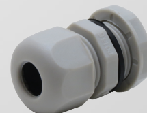
DS-PG-13.5 (Grey) DS-PG-13.5BLK (Black)