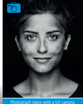
Photograph taken with a UV camera, showing skin damage due to UV exposure

Although UV is invisible, prolonged exposure over a lifetime can cause SERIOUS DAMAGE – TO SKIN AND EYES.