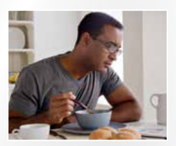
Outstanding all-day vision

ZEISS DriveSafe Individual – the only pair you'll need to make driving feel safer and to provide excellent all-day vision. Includes built in full UV protection, up to 400 nm.