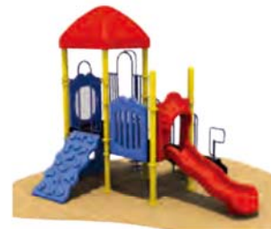
RED RIVER – PRIMARY