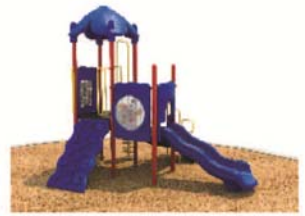
BLUE MOON- PRIMARY