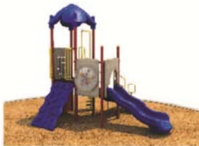
CASTLE – BLUE