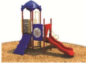
FIRECRACKER – PRIMARY