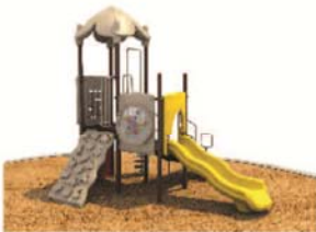
PIRATE SHIP – YELLOW