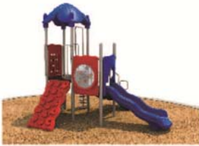
PLATINUM – PRIMARY