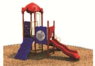
RED RIVER – PRIMARY