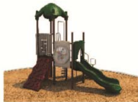
BACKWOODS - NATURAL