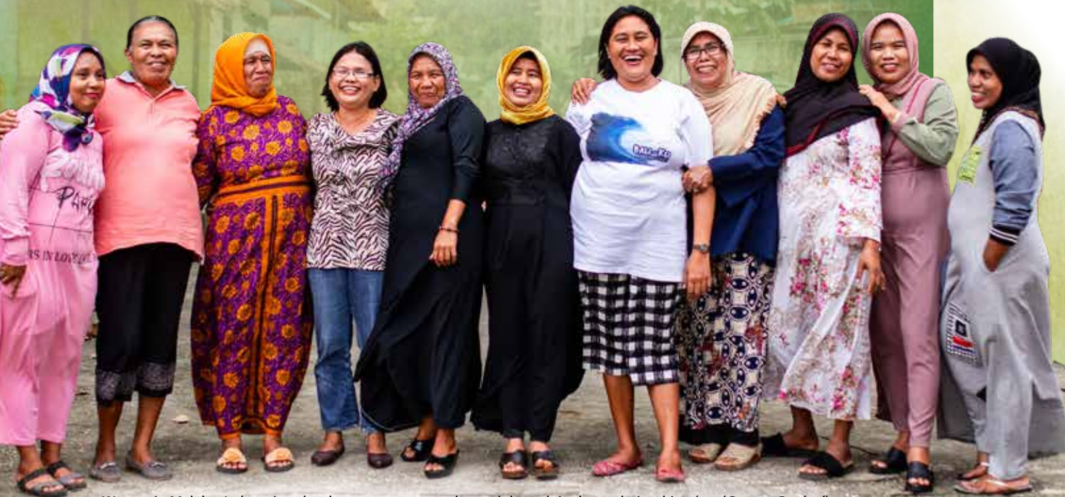
Women in Maluku, Indonesia, who share a common garden and through it, deep relationships (see 'Grow a Garden').