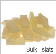
Bulk - slats