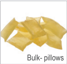
Bulk - pillows