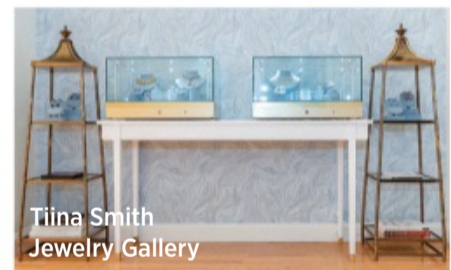
Tiina Smith Jewelry Gallery

"My love for vintage jewelry began at a young age when my grandmother bought me an antique emerald ring in Italy."