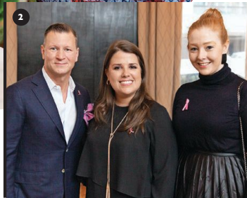
La Prairie Dinner at Menton