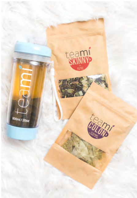
TEAMI DETOX STARTER PACK