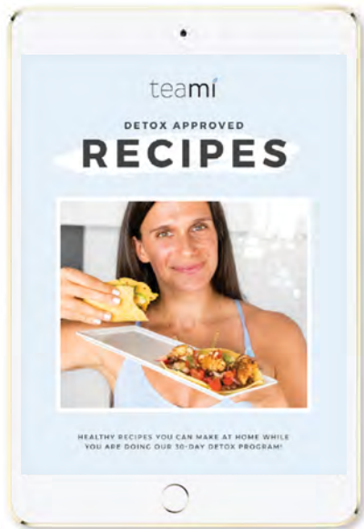
TEAMI DETOX APPROVED RECIPES

If you're wondering...."Okay, so what do I eat instead?", we have a few Healthy Recipe ebooks that you can download absolutely free!