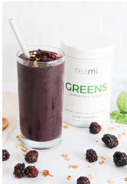
TEAMI SUPERFOOD GREENS POWDER