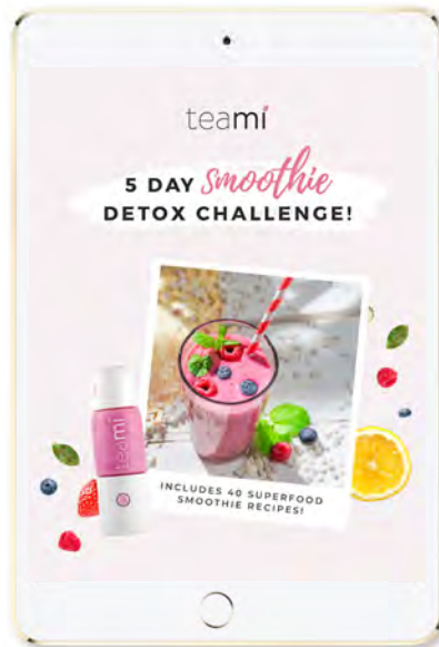
TEAMI 5 DAY SMOOTHIE DETOX CHALLENGE