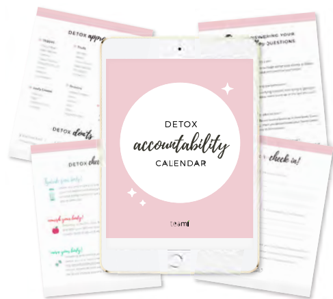
TEAMI DETOX ACCOUNTABILITY CALENDAR

Last but not least, I wanted to make a downloadable Accountability Calendar that you can print out at home or use on your phone, to keep track of your progress on your 30 Day Detox Program! When you get your detox in the mail it DOES come with a small, 1 page calendar that you can place you on your fridge or at your desk....but this Detox Accountability Calendar is a daily check in and reminder....AND gives daily health tips!