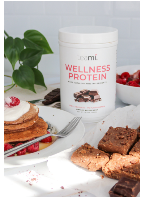
TEAMI WELLNESS PROTEIN - CHOCOLATE