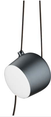
FU009023BSS03 Anodized Blue Steel