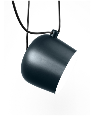
FU009523 Anodized Blue Steel