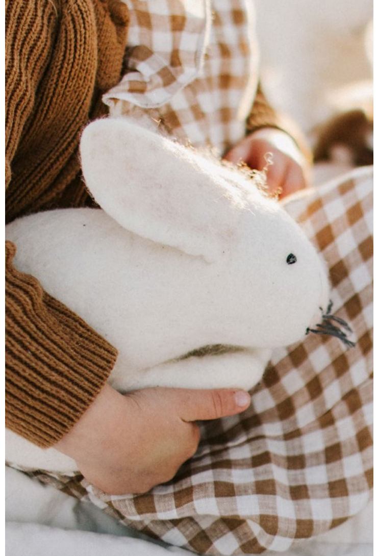
AT RIGHT: #FBWM Hand Felted Bunny