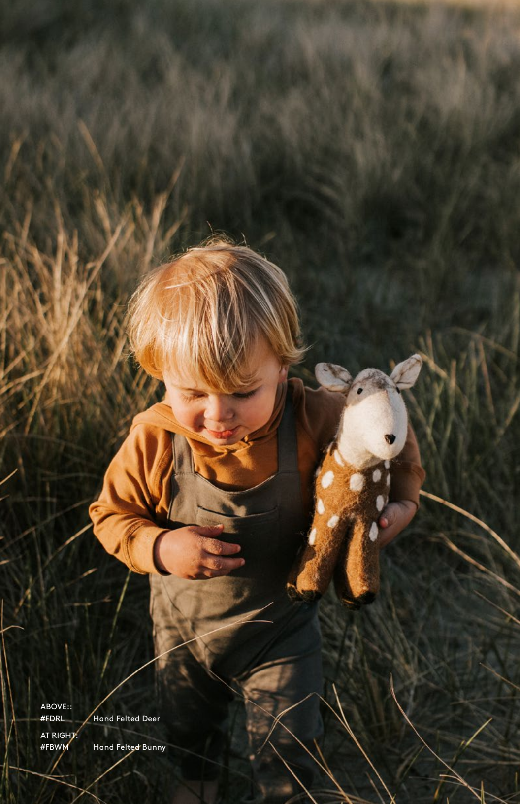
ABOVE:: #FDRL Hand Felted Deer