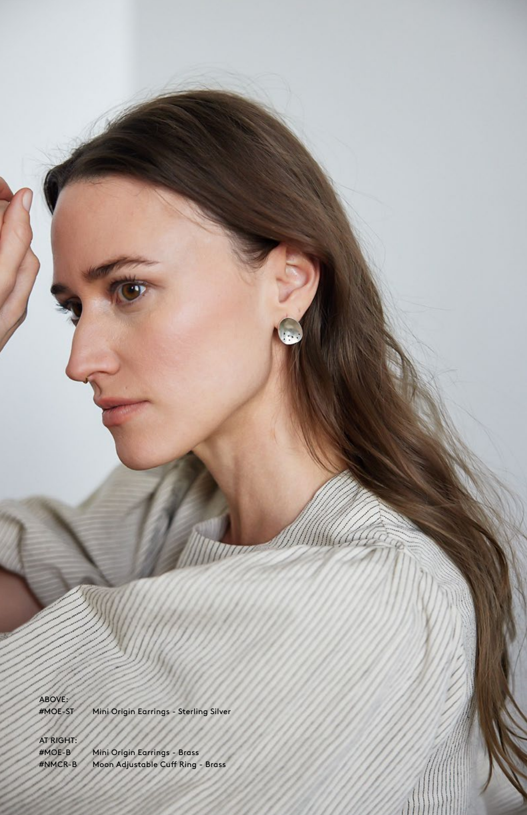
ABOVE: #MOE-ST Mini Origin Earrings - Sterling Silver